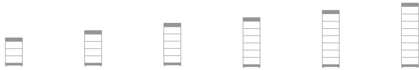
HVL 12.0 HVL 16.0 HVL 20.0 HVL 24.0 HVL 28.0 HVL 32.0