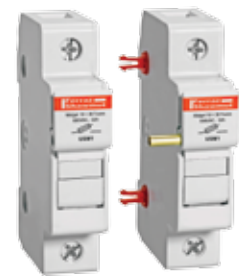
USM1 with USPTH Pin-Ties